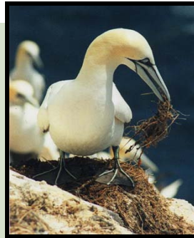
GANNET [ 90 cm ] Gainead

Oystercatchers and Herons can also be spotted up here, although they are wetland birds who generally feed on Ardmore Strand below.