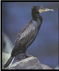
CORMORANT [80- 100cm] long Broigheal

Large, dark seabird with long, hook tipped bill. In good light plumage has oily sheen. In summer, adult has white patch on face and thighs; in winter thigh patch lost and face