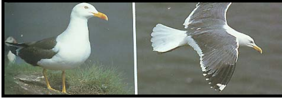
LESSER BLACK-BACKED GULL. [ 53-58 cm]